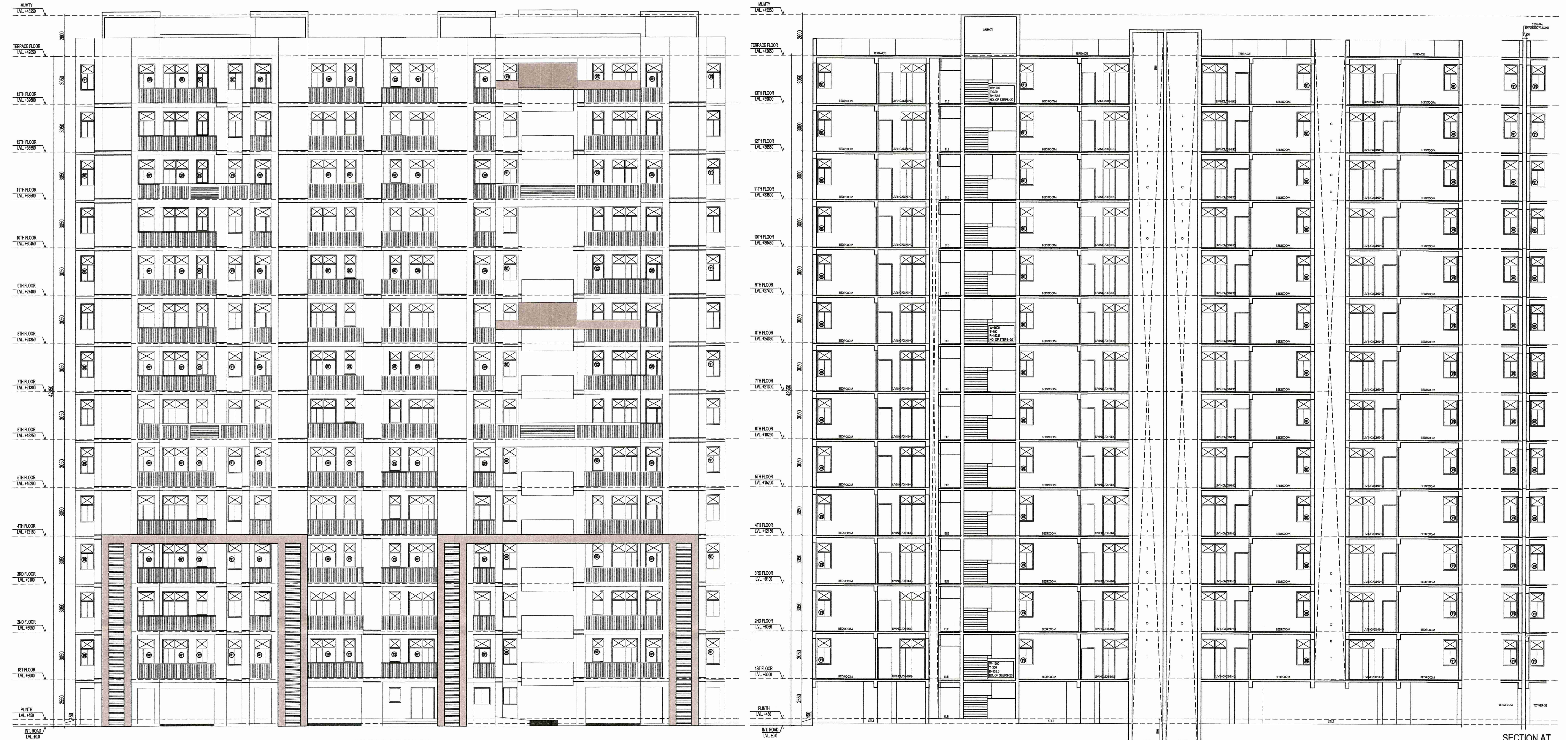
FRONT ELEVATION SCALE: 1:100